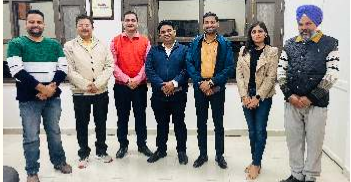
PHOTO WITH TEAM OF JINDAL SAW LIMITED, GUJARAT DURING PLACEMENT DRIVE