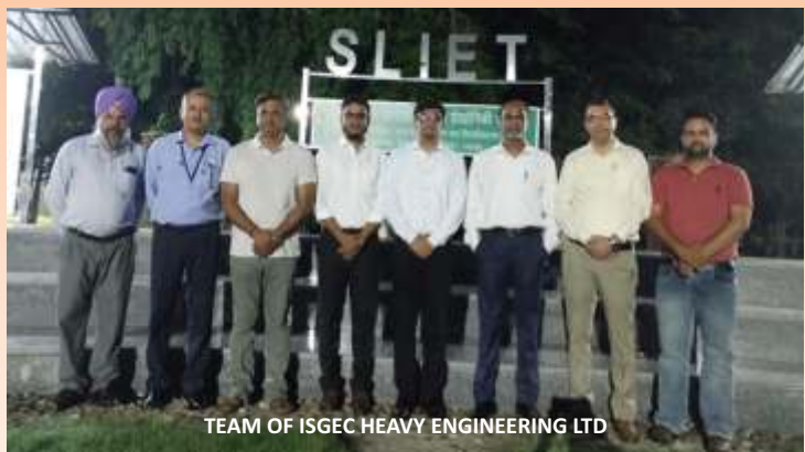
TEAM OF ISGEC HEAVY ENGINEERING LTD