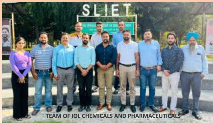
TEAM OF IOL CHEMICALS AND PHARMACEUTICALS