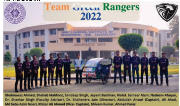
Team with Director, SLIET