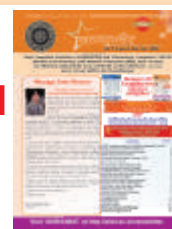
Vol. V, Issue IV

MOMENT OF CELEBRATION 5 years of ANSHUMAT