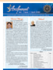
Vol. 1, Issue 1

MOMENT OF CELEBRATION 5 years of ANSHUMAT