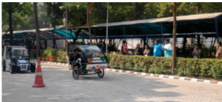
SLIET Efficycle #37 racing in 'Conventional Efficycle Segment'

The SLIET team Efficycle #37 performed well in Endurance Race (Durability Test) and covered 18 laps, without any breakdown, and bagged overall 5 th rank.