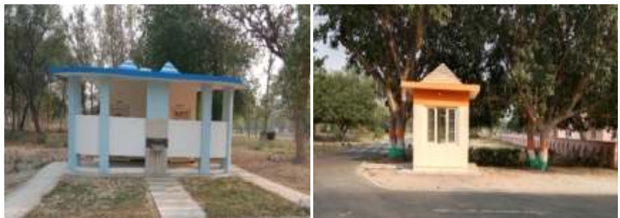
Centre Public Convenience in Lake Area & Security Check Post Near Health Centre

In a continuous effort to make campus more beautiful and student friendly augmentation/value addition of facilities in SLIET campus were carried out by Estate Office. Bus shelter near the Student activity centre