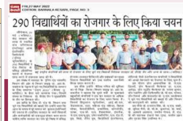
Mera Swaraj Education Support Program: Our Following students are selected by Mahindra Group under the program Mera Swaraj Education Support Program. Mahindra Group will provide Rs. 95000/- (per selected student) as stipend upto 3/4 years and PPO in Mahindra Group (if performance is satisfactory):