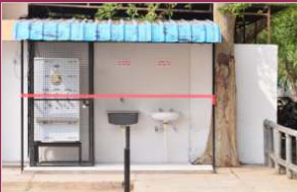
Water Cooler in the Shopping complex