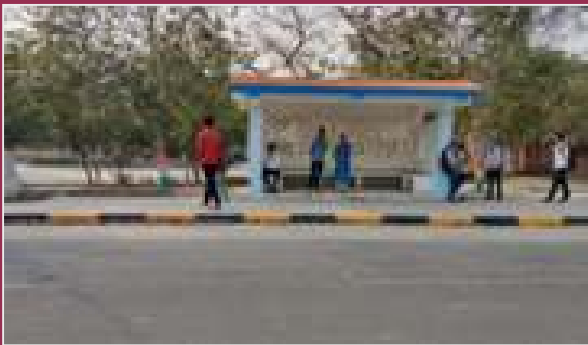
Bus Stop Near Student Activity