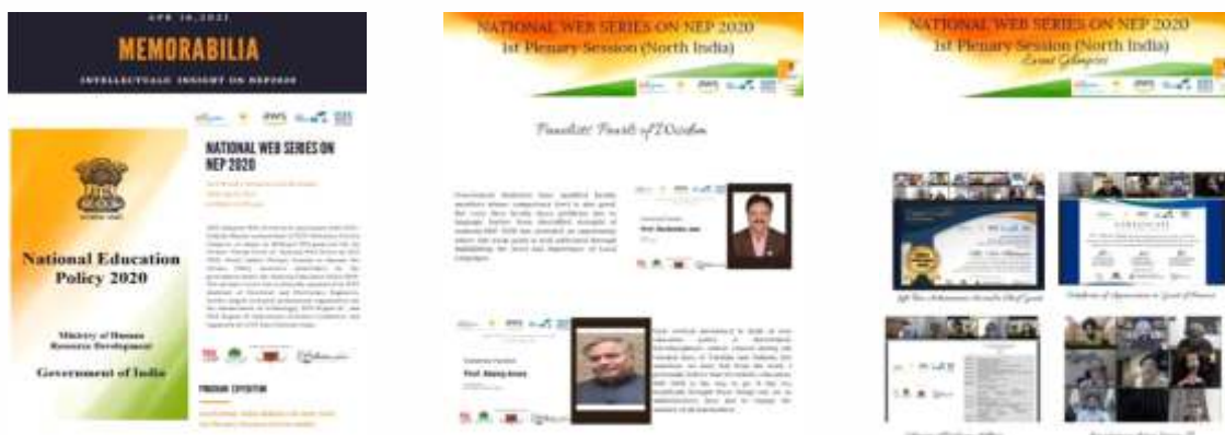
Glimpses of National Web Series on NEP 2020

This premier event was technically sponsored by IEEE (Institute of Electrical and Electronics Engineers) Region 10, which happens to be the world's largest technical professional organization for the advancement of technology and IEEE Region 10 Educational Activities Committee and organized by iGEN Edu Solutions India.