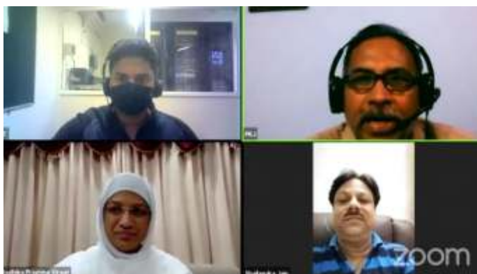
Webinar on Neuro - Linguistic Programming