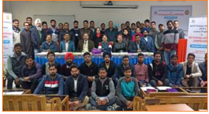
Participants of ATAL course on "3-D Printing and Design"