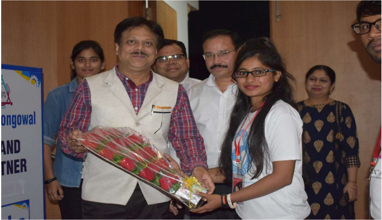
Director SLIET welcomed by Social Fest-2019 reception committee members