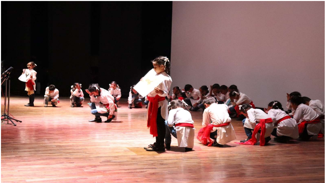
Kids Show organized during Social Fest-2019 inauguration ceremony by Longowal Children's