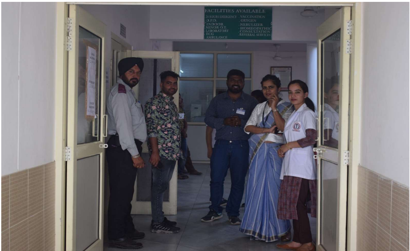
Cancer Awareness Team from Sangrur Homi Baba Cancer Hospital organized a medical camp