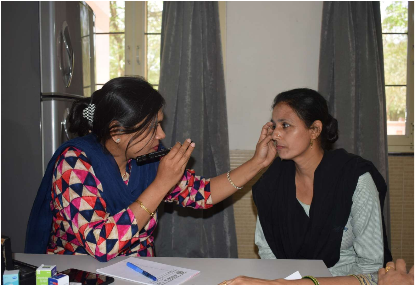
Eye Testing during Medical Camp at SLIET Health Centre, Longowal