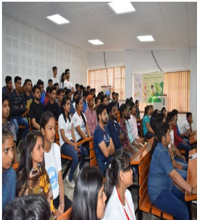
Audience that attended the session