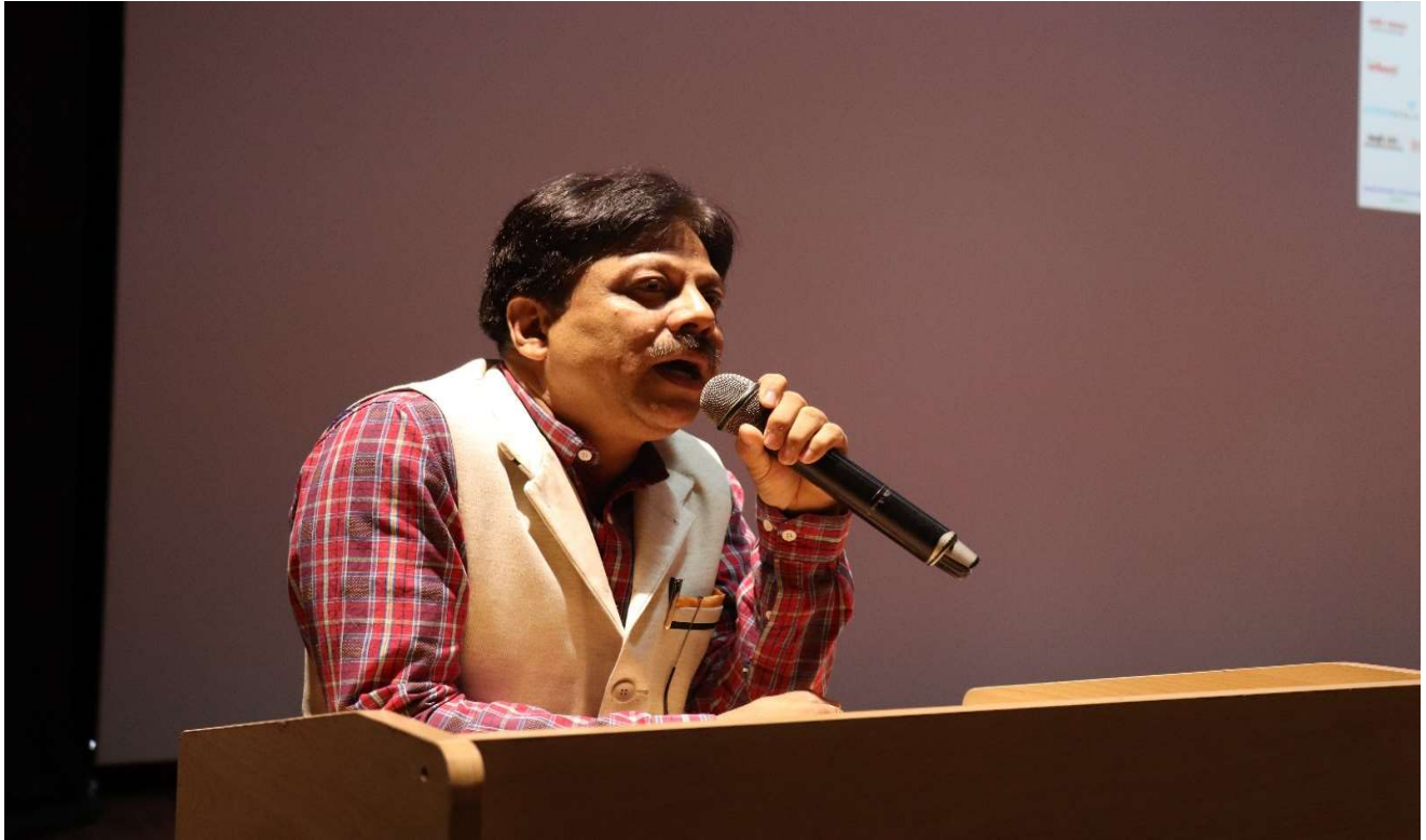
Director SLIET addressing to audience during Social Fest Valedictory Function of Social Fest-2019