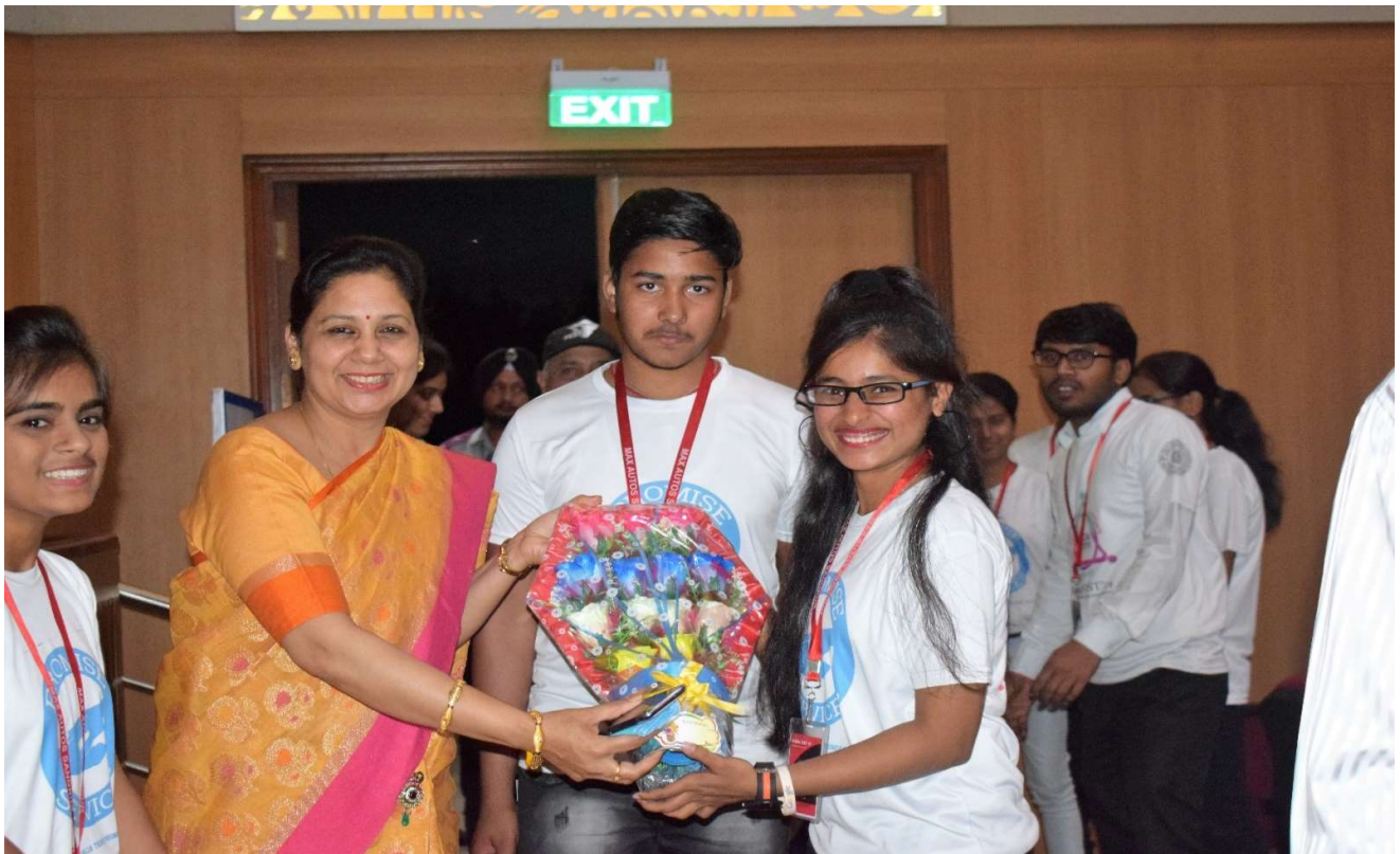
Madam Director was welcomed by Social Fest-2019 reception committee members