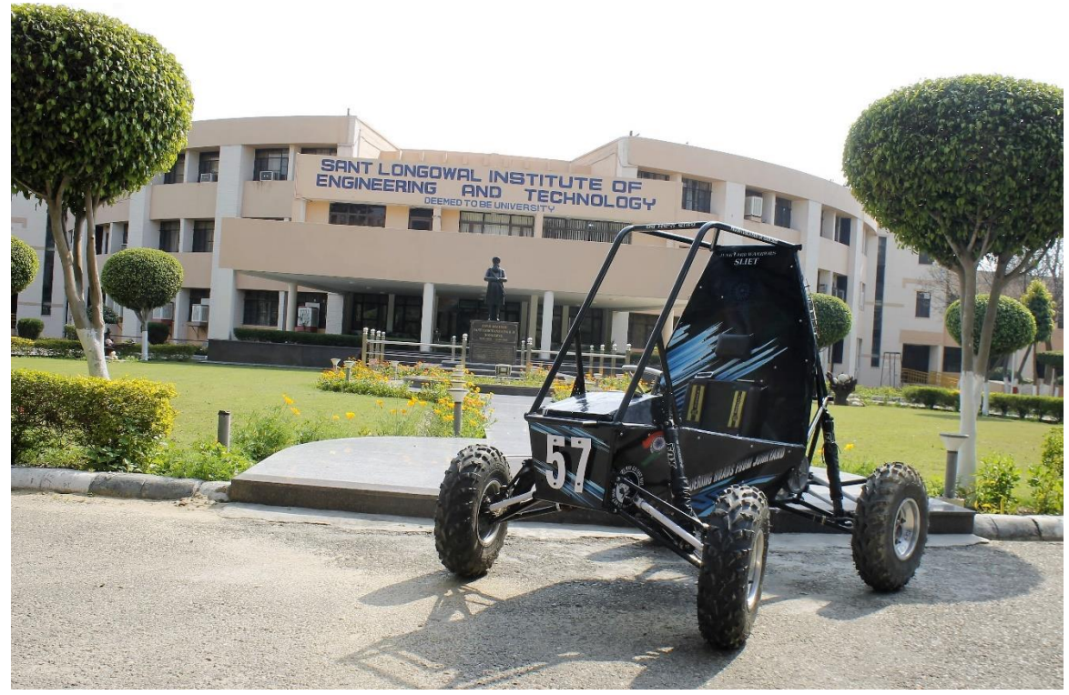
SLIET ATV 2019 (#57)

Baja SAE India has never been merely an event to the team "Junkyard Warriors", but a challenging platform to excel their capabilities.