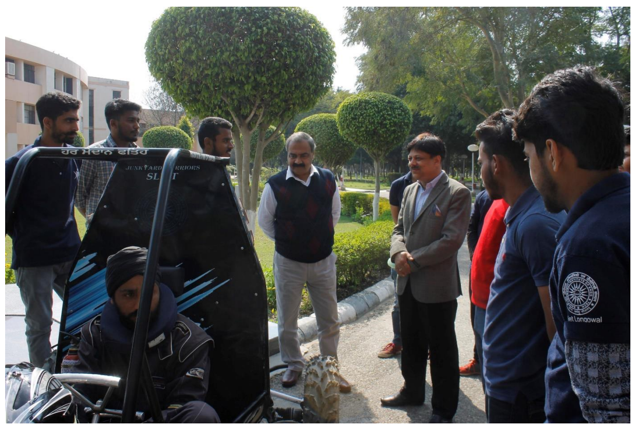
SLIET Team 'Junkyard Warriors' interacting with Director, SLIET before proceeding to the event.