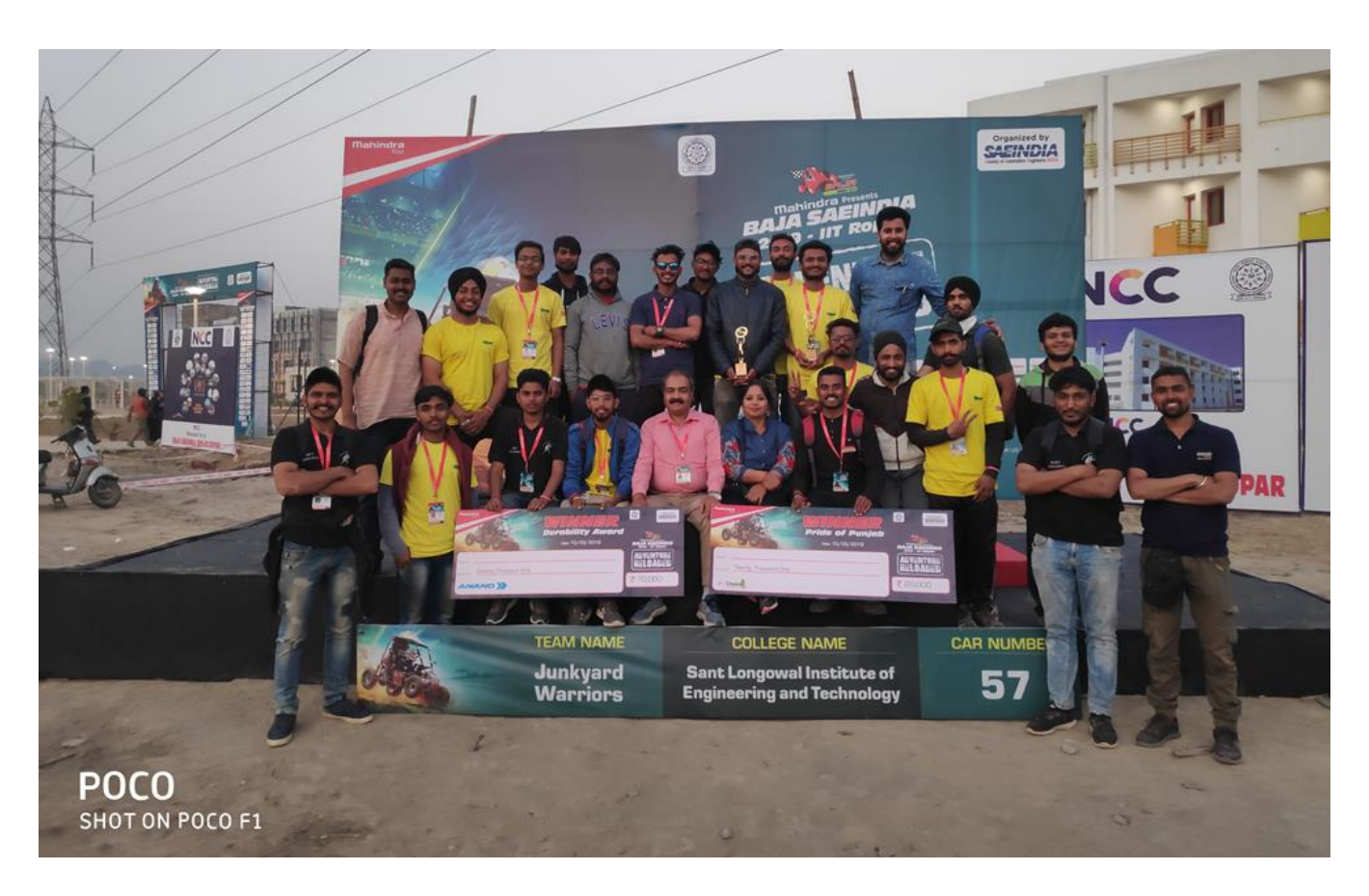
The victorious SLIET team 'Junkyard Warriors'.