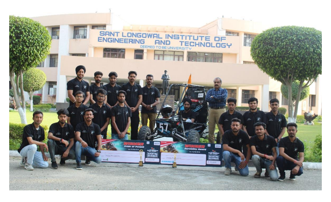
The victorious team 'Junkyard Warriors' on return at SLIET