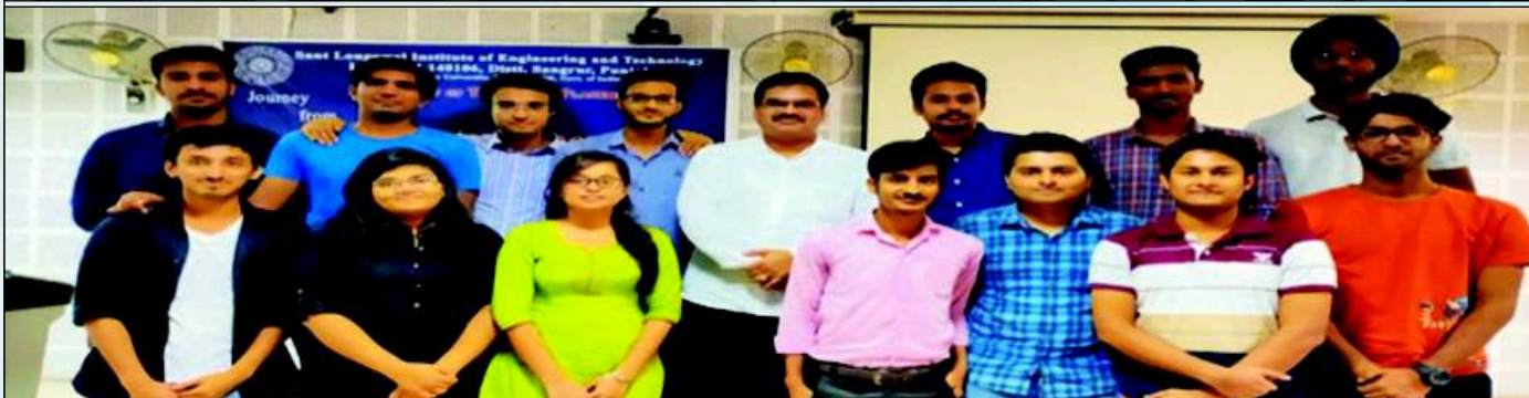
Students Placed In Capgemini Technology Services India Limited