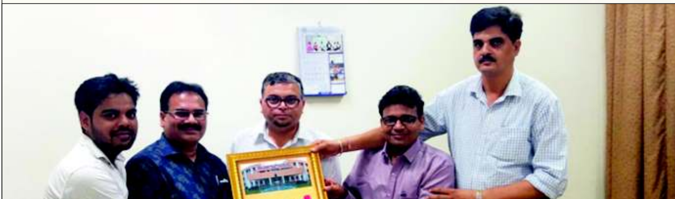
Thanks to Our Recruiters ISGEC

Good number of our students got placed in the above-mentioned companies. Head (T&P) expressed his thanks to all concerned especially Training and Placement Officers, Faculty Placement Coordinators, Student Placement Representatives & staff deputed during hiring process. Following few pictures witnessing the moments.